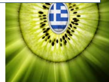
BUSINESS PROCESS ANALYSIS OF FRESH KIWIFRUIT EXPORTS FROM GREECE TO CHINA